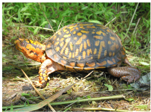
Designed for use with The Woods in Your Backyard , 2<sup>nd</sup> edition