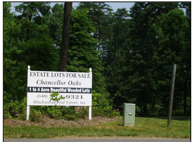
Demand for affordable housing and preference for wooded lots are two common factors contributing to forest fragmentation across Virginia.

Fragmentation tends to separate and isolate forested parcels. This leads to changes in wildlife habitat and the ability of a forest to produce products and amenities. Fragmented forests abound with wildlife habitats beneficial to generalist and edge species. Deer, squirrels and rabbits, for example, do well with a mixture of open,