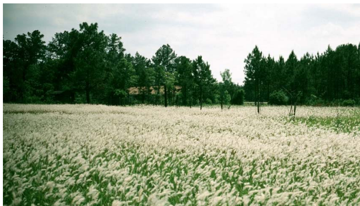
Although cogongrass starts in circular infestation, left unchecked it can take over large open areas very quickly.

Cogongrass forms large, dense, circular infestations underlain by thick mats of thatch from the rhizomes. These infestations shade out native vegetation, compete with native vegetation for soil moisture, and prevent native seeds from germinating (by preventing them from reaching the soil). Cogongrass is adapted to all light and soil conditions except dense