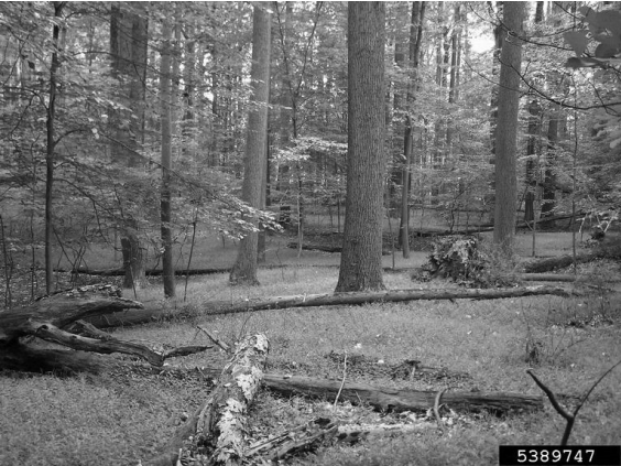
Wavyleaf basketgrass covers the floor of this intact forest.

In an effort to eradicate this species before it becomes well-established throughout Virginia, a WLBG Task Force has been formed. And they are looking for help from the commonwealth's citizens. The first thing you can do to help is to report new sightings of WLBG. If you have a smart phone or tablet, there's a free App mapping available at www.towson.edu/wavyleaf . Once installed, you can record the percent of an area infested, record if you implemented any control measures, use the GPS function on your device to record the exact location of the infestation, and use the camera to submit photos. This reporting system allows the task force to monitor new infestations.