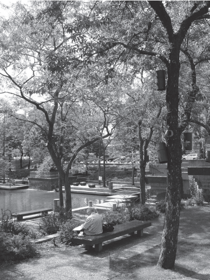
Urban forests bring nature into the built environment, helping create sustainable and viable communities.

And finally, trees keep our towns cool. We all know that under a shade tree is the place to be on a summer day. Just imagine magnifying that effect hundreds of times throughout the community by planting trees. When we do that, we're helping to cut