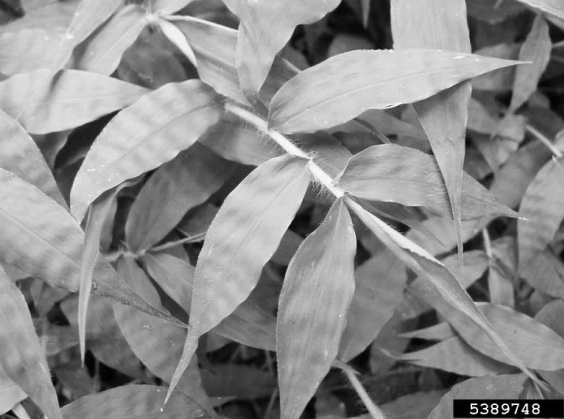
Notice the distinctive pleated waves along the blades of wavyleaf basketgrass.

Regular readers of this column know how much I love the doom and gloom aspect of exotic invasive species; leaving readers with a sense of despair and sadness is my goal. This quarter, however, in anticipation of the soon-to-come warm spring days, I have decided to have a lighter and brighter attitude. In that vein, I'm featuring an exotic invasive species against which we have a chance! Wavyleaf basketgrass (WLBG) is a relatively new invader in the Mid-Atlantic, having first been found near a landfill in Maryland in the late 1990s. The actual method of introduction is a mystery – the horticulture industry does not sell WLBG in the US. Speculation is that WLBG seeds somehow ended up in a discarded hanging basket in the landfill. But no one really knows.