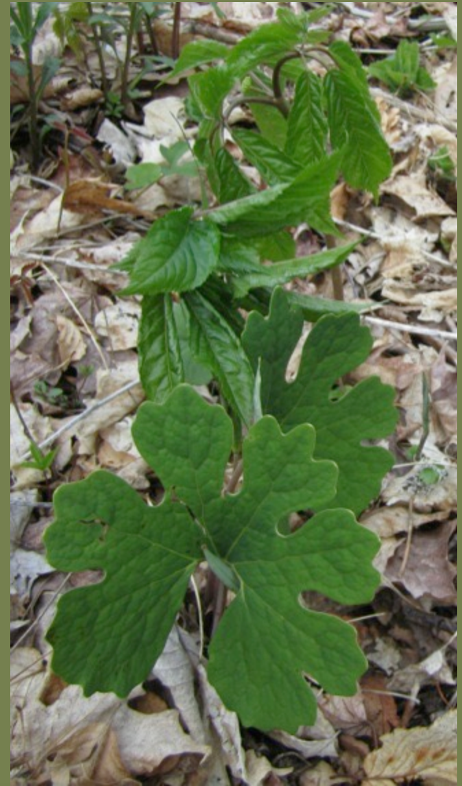
Trillium (left); Bloodroot (above)