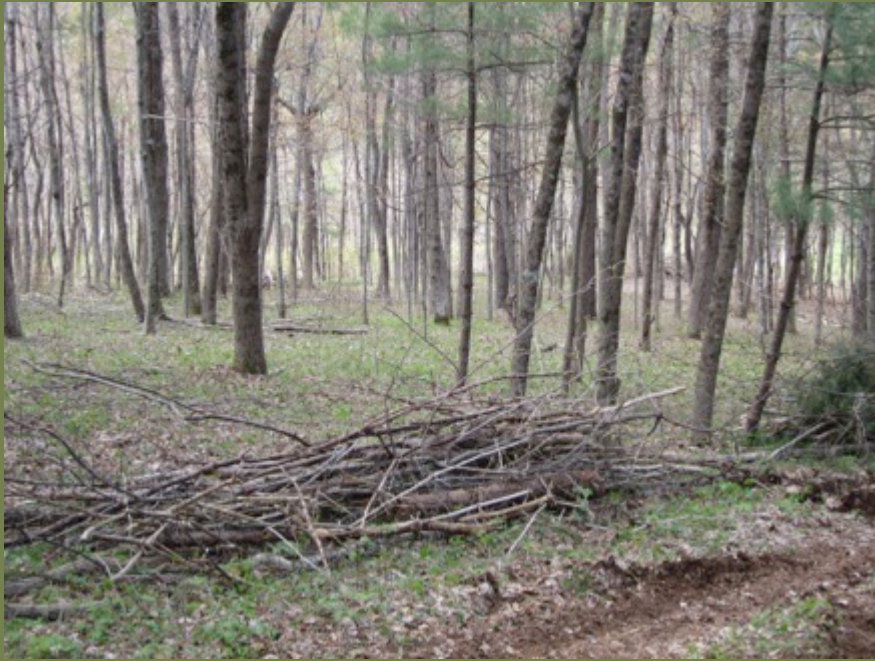
Cleaning and clearing site

Raking & planting beds. Adding gypsum (for Ca) and phosphate fertilizer 0-45-0