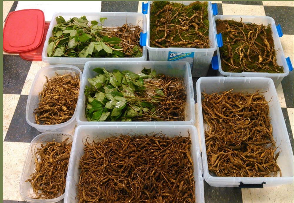
Wild ginseng harvest is still actively practiced