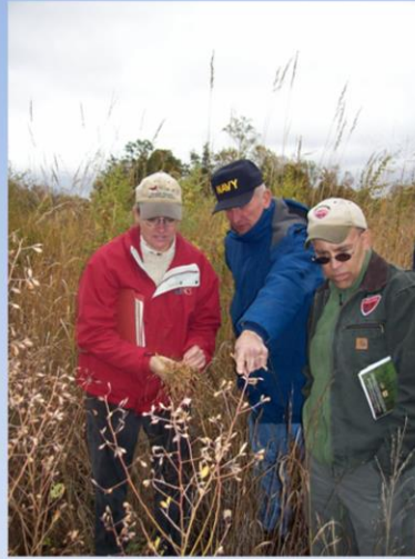
Virginia Forest Landowner Education Helping Virginians Keep Their Woodlands Healthy and Productive Real Forestry for Real Estate

There is a comprehensive list of all these groups along with their contact information in your packets. Please feel free to share this information with any potential clients you have. We hope this portion of the class has given you the idea that landowners are not on their own once they purchase a piece of land – there are many natural resource professionals who can help!