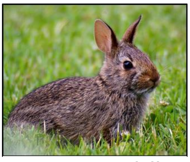
A young eastern cottontail rabbit. Photo by: Jen Goellnitz. Creative Commons — AttributionNonCommercial 2.0 Generic — CC BYNC 2.0.

As a Virginia woodland owner, you are probably quite familiar with the eastern cottontail (Sylvilagus floridanus). Every morning as I drive to work I pass a few (and sometimes follow one as it jumps ahead of me along the road). You may not be as familiar with other rabbits that may be found or have historically occurred in restricted areas of Virginia, such as the Appalachian cottontail (Sylvilagus obscurus), marsh rabbit (Sylvilagus palustris), Mearn's eastern cottontail (Sylvilagus floridanus mearnsii), Smith's Island cottontail (Sylvilagus floridanus hitchensi) or the nonnative black-tailed