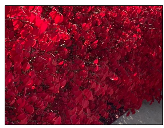
Winged euonymus surrounds Lane Stadium on the Virginia Tech campus and displays bright maroon foliage in the fall.

Orange and maroon are not only the colors of Virginia Tech and the Hokies, but also the dominant colors of fall in SW Virginia. And it just so happens, I love orange and maroon, the Hokies, and fall. They go together well. And the folks in charge of landscaping at Virginia Tech have made a concerted effort to landscape with species that are orange and/or maroon in the fall – particularly around Lane Stadium.