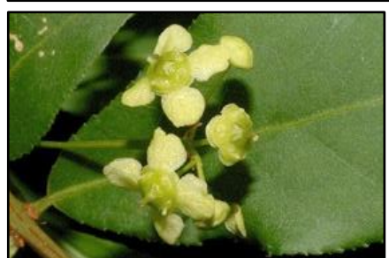
Winged euonymus (a) stem with irregular edges called wings, (b) leaf with serrated edges (like a bread knife), (c) oppositely-arranged leaves and twigs, (d) orange-red mature fruits, and (e) small yellow-green flowers.

Control: Fortunately, winged euonymus leafs out early in the spring and retains its leaves late into the fall. This makes it easy to see (especially the maroon leaves in the fall) and easier to control.