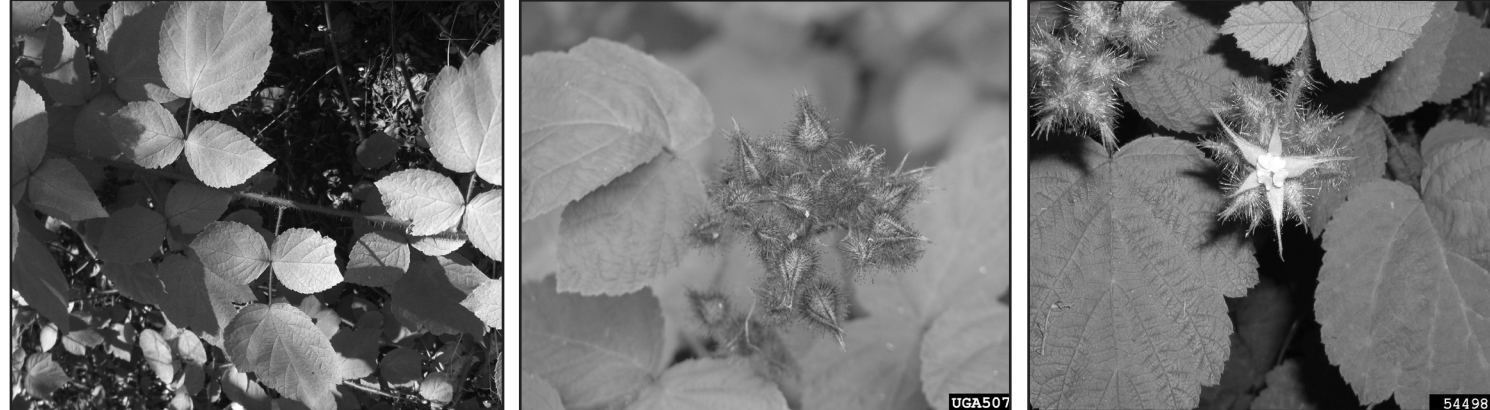
Wine raspberry leaves are alternately arranged, compound, with three toothed leaflets (left). Unopened (center) and opened (right) wine raspberry flowers. The flower itself is comprised of 5 white petals. These are surrounded by five hairy sepals that help protect and support the flower.