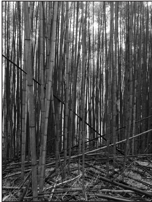
Removing an established bamboo population can be costly and time-consuming.

What happens if you plant your acreage with bamboo? It’s not cheap to plant, and planting is done by hand. There can be relatively high mortality of newly planted bamboo. But let’s say you do get it planted. Then what? You need to keep bamboo weed-free early on, and it may require fertilizer, depending on the soil qualities. If it doesn’t rain, you’ll need to water the bamboo, especially for the first year. Assuming your bamboo makes it through the first year, you’re still several years away from a harvest. How many years depends greatly on the location and weather. Bamboo likes it warm, so a couple of cool years will set back any growth projections you may have been shown, likely delaying that first harvest (and first opportunity to make any money on your bamboo). And how does one harvest bamboo? By hand. You read that right – most bamboo is harvested by hand. Basically, it’s cut down and loaded onto trucks. In most cases this will be under contract from the organization promoting it, and they’ll buy back your product.