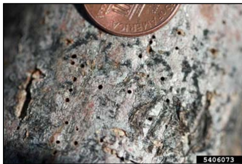
Dead walnut twig showing the exit holes of the mature walnut twig beetle. A single 4" block of walnut was found to contain more than 20,000 beetles.

The beetles are tiny—about 1/16 inch (smaller than a grain of rice), but they make up for their size with numbers. Researchers have found as many as 20,000 beetles in a four-foot section of a small walnut log! By themselves, the beetles cause only minor damage to the walnut trees. The fungus they bring with them infects the tunnels, killing the cambium layer of the tree, and cutting off the food supply. The tree literally starves to death. The dead cambium forms cankers, which gives the disease its name. The fungus is so deadly to black walnut trees, that it has been named Geosmithia morbida .