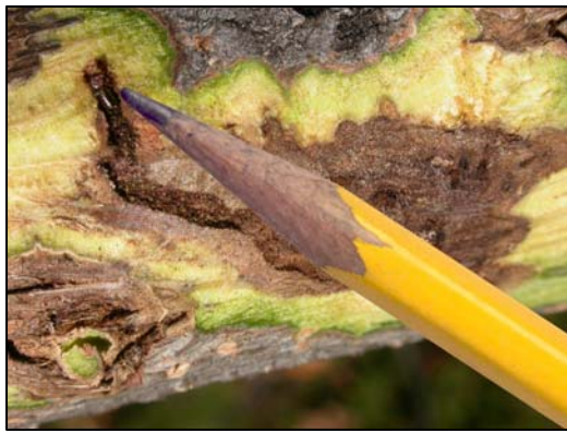
Walnut twig beetle. The pencil was added to show scale. Their small size makes diagnosis extremely difficult. The relationship between the beetle and the fungus associated with them is still not understood.

There are steps you can take to help stop the spread of this disease to black walnut's native range. Do not sell or