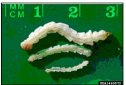
EAB larvae in various stages of development.

Though no current large-scale level controls are known, there is some