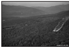
Aerial spraying to slow the spread.

If you notice signs of extensive gypsy moth infestation on your property, contact your county agriculture agent ( www.ext.vt.edu/offices ), VDACS ( www.vdacs.virginia.gov ), Virginia Department of Forestry ( www.dof.virginia.gov ), or U.S. Department of Agriculture ( www.aphis.usda.gov ). These agencies are equipped to chemically treat large areas. Treatments include: Disrupt® II, which is a synthetic pheromone, similar to the one emitted by the female moths to attract males. Releasing this synthetic pheromone confuses the males and prevents them from finding the females, thus disrupting mating; Bacillus thuringiensis (Bt), a natural soil bacteria, is toxic to gypsy moth larvae; Gypchek®, is a naturally occurring virus which is toxic to the larvae; and Dimilin, an insect growth inhibitor, which is used for moderate and high larval populations.